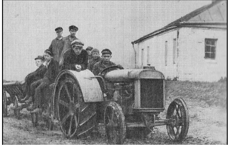
DESTROYING THE DIVISION BETWEEN MENTAL AND MANUAL LABOR

changes." The "historic changes" that they are ushering in are part of preparing the schools for fascism and war!