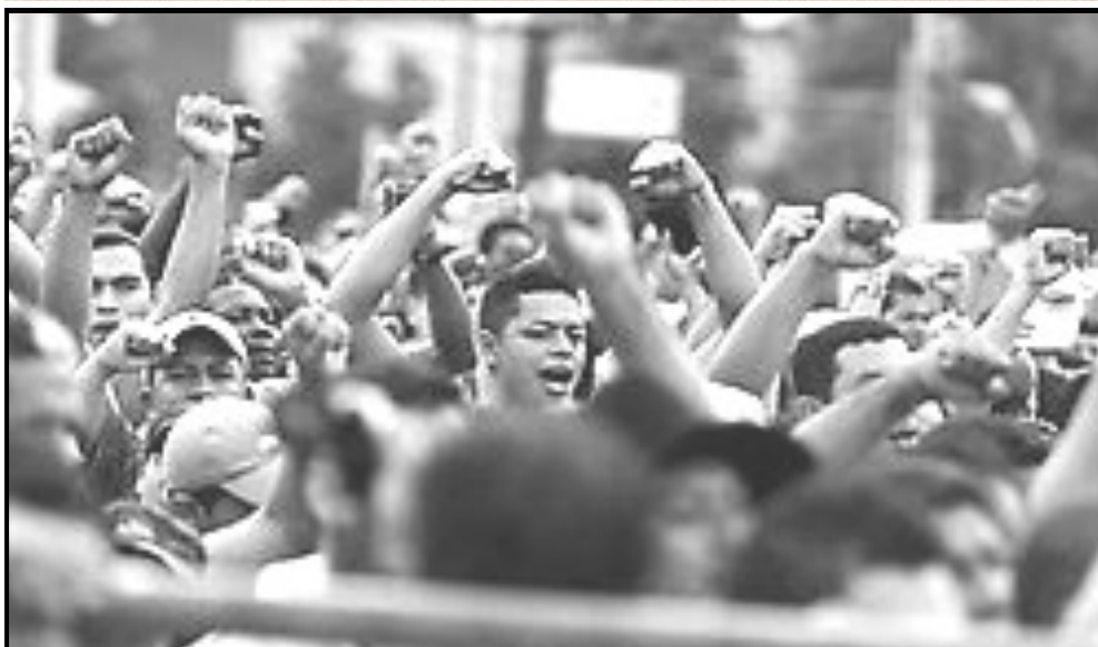
HONDURAS—Teachers on Strike, August, 2010—See article page 13