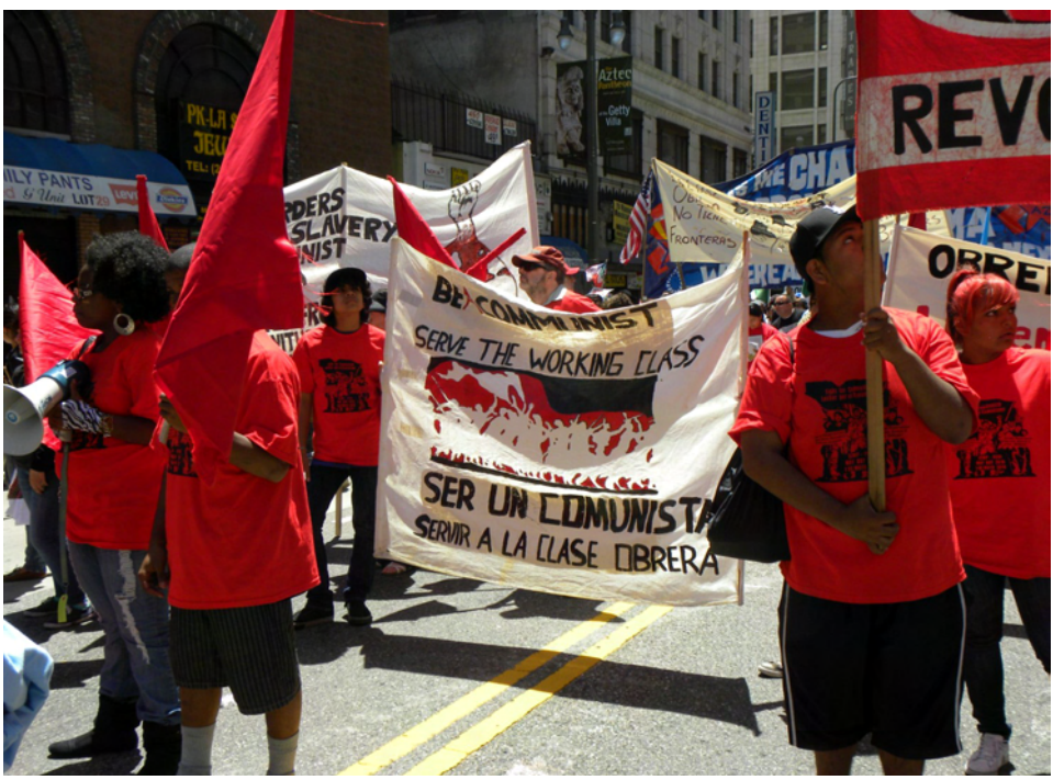
LOS ANGELES, CA.—MAY DAY MARCH 2010—ICWP YOUTH

Next issue of the Red Flag — The dialectics of inner-party struggle.