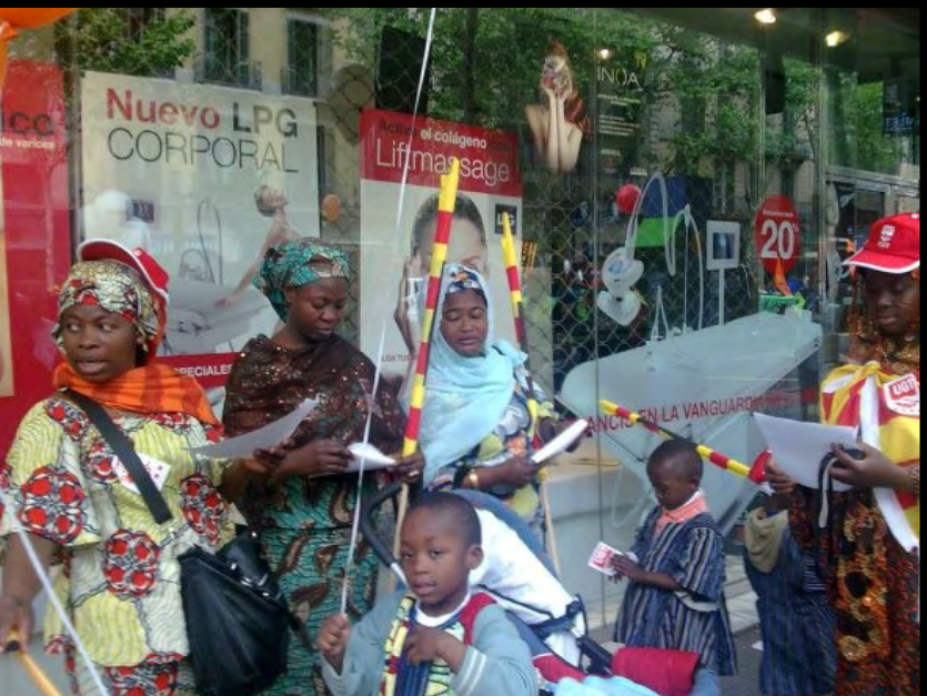
SPAIN, MAY DAY 2010 -YOUNG WOMEN READING ICWP LEAFLET

We thank the comrade from Spain for his letter, and send our great appreciation for his work in organizing for the ICWP there. In Spain there were several marches, including a mass march lead by the bosses' agents of the UGT and the CCOO as well as other smaller marches led by "leftist" groups. All these groups are the offspring of the old revisionist movement. The main failure of the old movement was that it fought for socialism; they were not able to see the contradiction