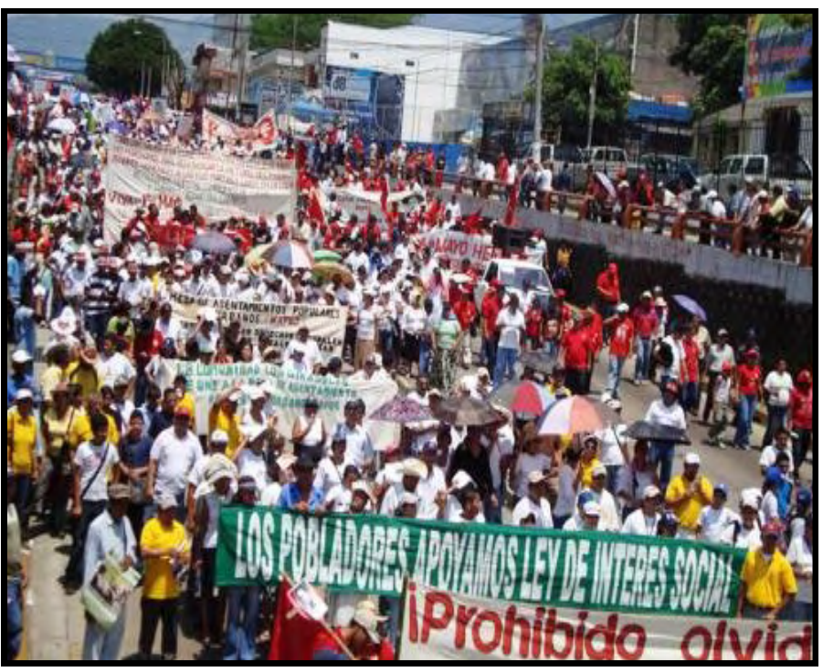
SAN SALVADOR—MAY DAY MARCH 2010

We ended both dinners singing our new battle song, Red Flag and the International. We called on the more than 160 participants in both dinners to participate in the May Day March, together with the ICWP contingents and to massively distribute our newspaper RED FLAG.