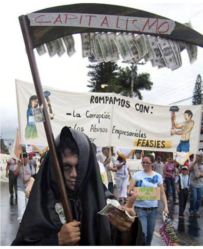
MAY DAY MARCH 2010—SAN SALVADOR

However, the letter says, "In the second edition there was a small article that started to discuss education in Russia and China (when they were communist)." In