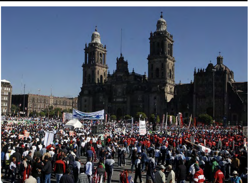
MAY DAY MARCH 2010 ON MEXICO