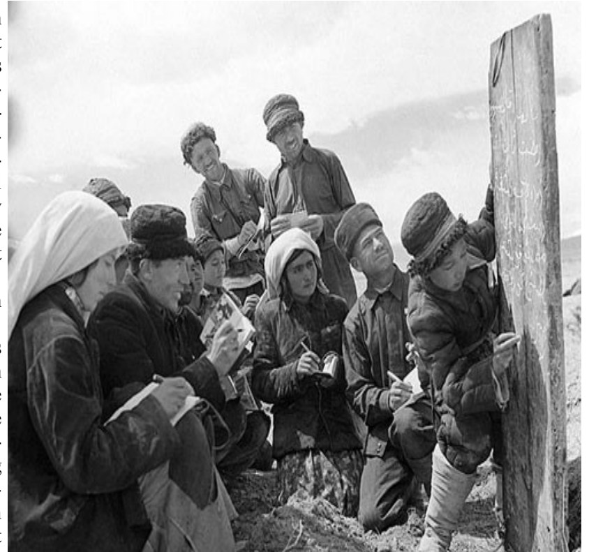
Young students lead literacy classes at Xinjiang Uigur Autonomous Region commune, China, 1960.

A critical question of dialectics is how contradictions behave over time. Pro-capitalists or revisionists (fake Leftists) often claim that the two sides of a contradiction can "peacefully coexist" for a long time. Union big shots discourage strikes and accept positions on corporate boards, promoting the illusion that workers don't have to fight the capitalists, but can "share governance." As the current capitalist economic crisis deepens, celeb-