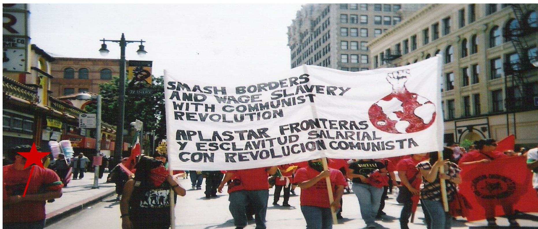
LOS ANGELES—MAY DAY 2009