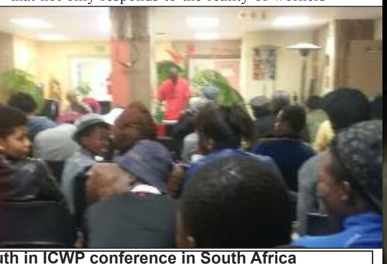
Youth in ICWP conference in South Africa

Red Flag is an important tool in the process of mobilizing the masses for communism. Let's distribute it, study it and write for it. Join the fight for a communist world!