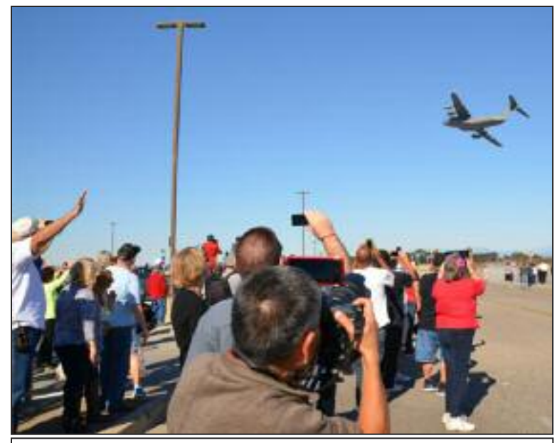
Workers wave goodbye to their jobs as the last Boeing C-17 military cargo plane takes off from Long Beach, CA, on Nov. 29. The plant, which had employed more than 2000 workers, will shut down at the end of this year.

Boeing has been able to do this by speedingup employees, automating and by shifting production to lower-wage areas and subcontractors. They are gutting the Boeing workforce in the Seattle area.