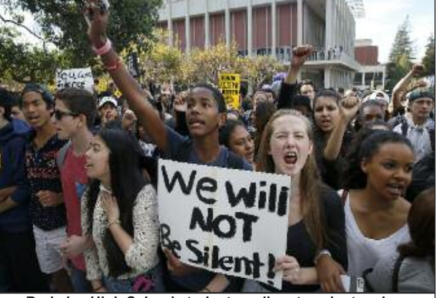
Berkeley High School students walk out against racism

Although the protests haven't stopped the cops from killing people, they have forced the ruling class to expand its tactics. On November 22, a Black Lives Matter activist was roughed up at a Donald Trump rally, with Trump's approval. The following day a UC