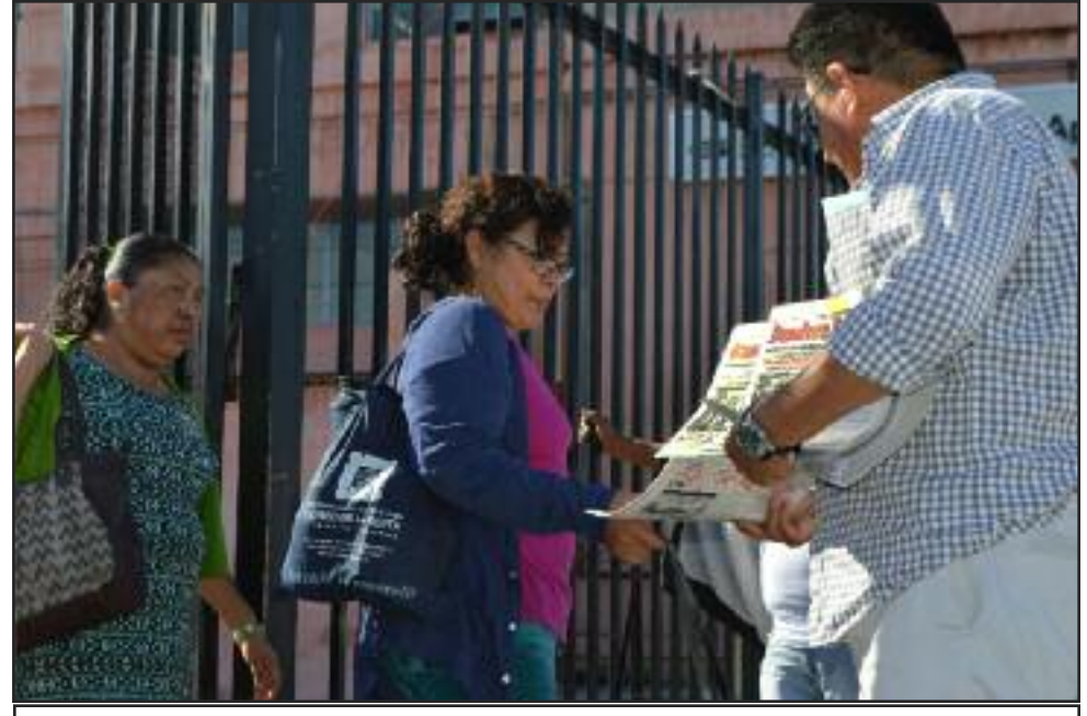
Workers at American Apparel taking Red Flag