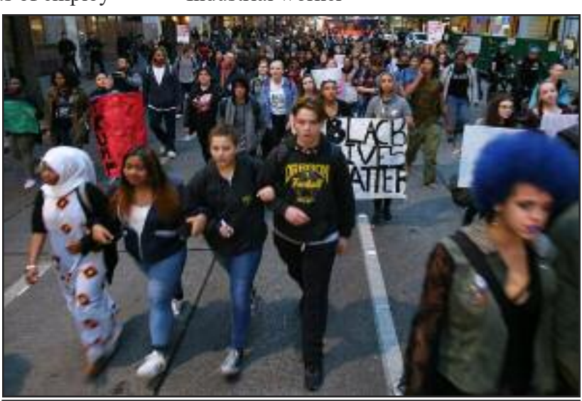
Post election protest in Seattle