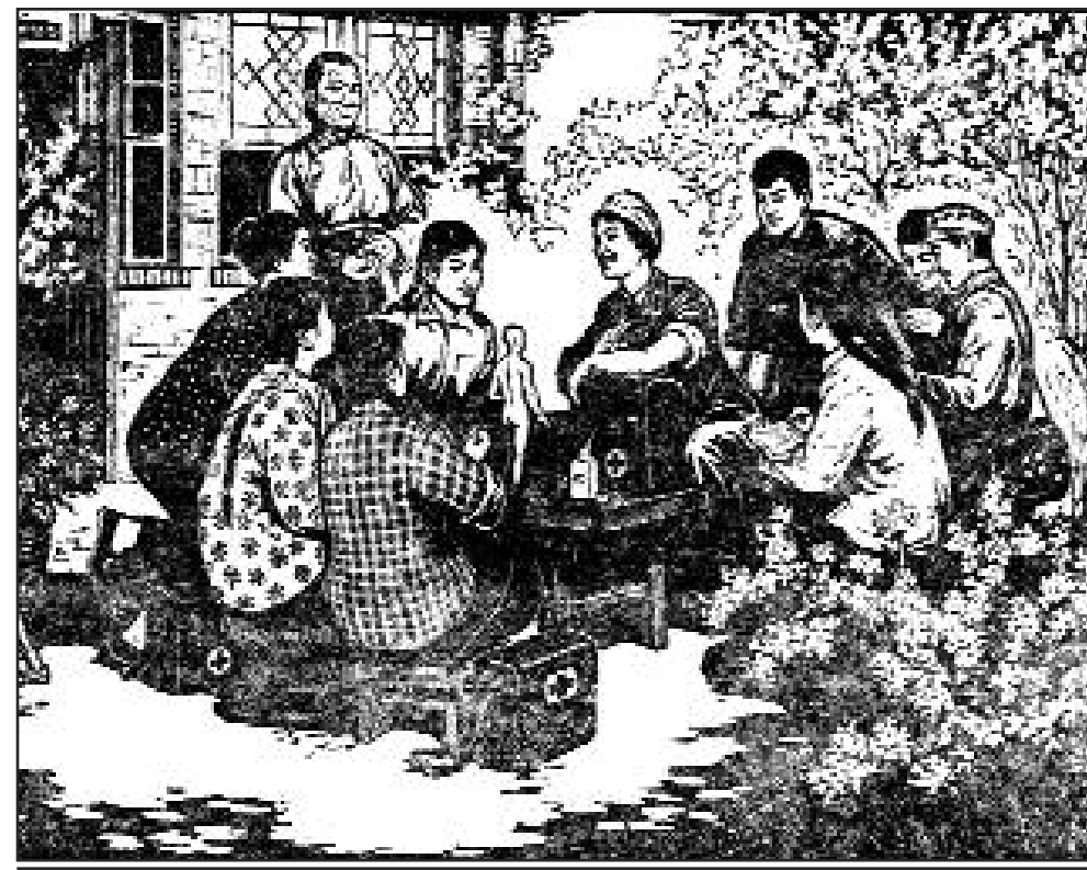
Barefoot doctors in China after the revolution mobilized the masses to insure healthy communities.

For adults, it's even worse because these centers are always saturated with patients and have no medicines. Sometimes they schedule surgeries up to a year later, which in most cases means imminent death. Women give