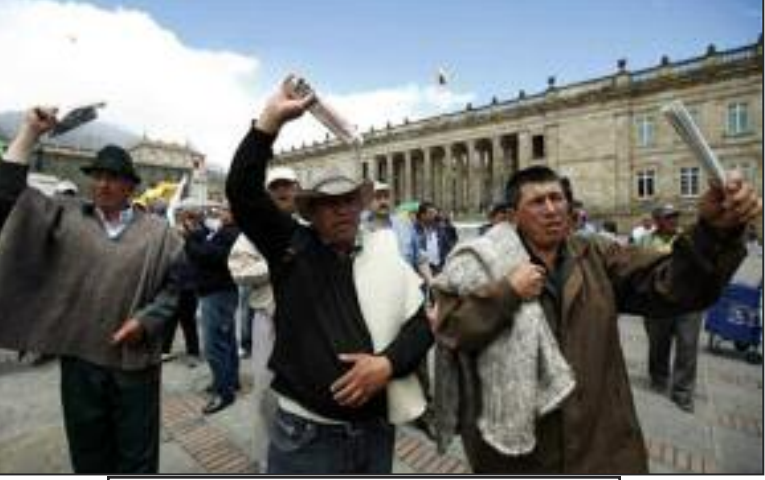
Farmworkers on strike in Colombia, Summer 2013

With love for the working class, -- Red Flag Readers