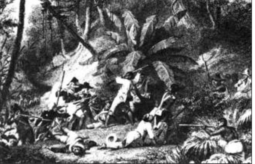
Contemporary Depictions of the Haitian Revolution Dishonestly Show the Victorious Slaves Surrounded by the French

By any objective point of view, Haiti in the late 1790s was the most unlikely place to project a successful revolution against slavery. Plantation slavery was central to the worldwide development of industrial capital. It provided super profits (a slave ship could return a profit of 300% on one