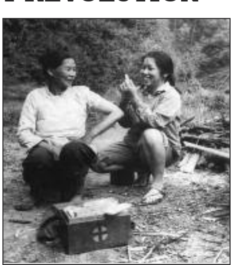
China's barefoot doctors in the 1950s & 60s have taught us valuable lessons about medical care freed from the profit system.

The capitalist healthcare system that we have today is really unfair because if you don't have the funds for treatment, the treatment you get isn't good or you get no treatment at all. In a communist healthcare system treatment would be pro-