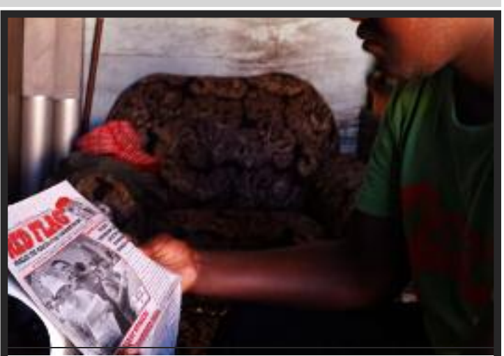
South Africa: as the class struggle heats up, ICWP grows among industrial workers. See article page 1.

Every area in the world is affected by the contradiction of China's growth and the US need to reverse its decline as well as prevent China and other imperialists from dominating the world.