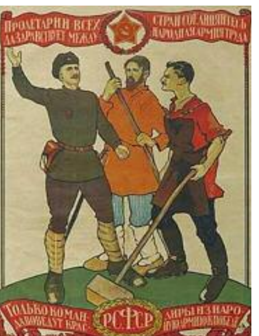
The unity of workers, soldiers and peasants was crucial to the Russian Revolution.

Today the International Communist Workers' Party works to build communist consciousness among all workers, students, soldiers and their relatives in Mexico and worldwide. We must see that the only solution is to kill the bosses and the capitalist system. No to reforms! Soldiers and workers of the world, let's unite for Communist Revolution.