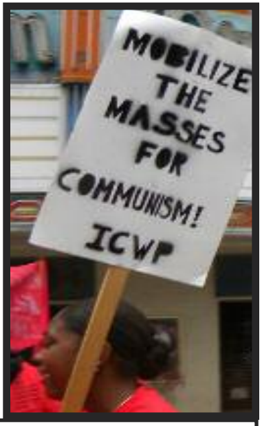
Demonstrations in support of Prop 47, such as the one on the left, funded by corporate donors in Liberty Hill Foundation, seek to steer youth away from a communist solution--see photo on the right.

"simple." But, to the rulers' dismay, it will not means necessary. This creates a "me-first" culfail.