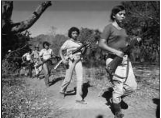
El Salvador 1980s