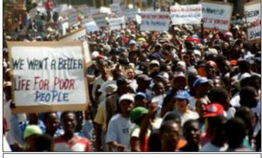
Protest in Haiti, October 2016

The racist wage slavery of capitalism-imperialism is the source of all the miseries facing Haitian workers and all workers. ICWP is mobilizing worldwide to destroy capitalism with communist