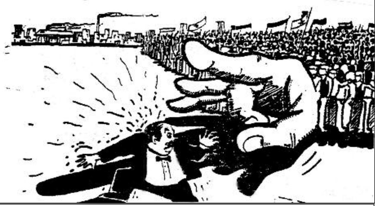
Read our pamphlet: The Industrial Working Class and Communist Revolution available on at icwpredflag.org/IndustrialE/WorkE.pdf.

Class society, which developed in the last eight thousand years, changed this. Human labor power was made captive to produce mainly for