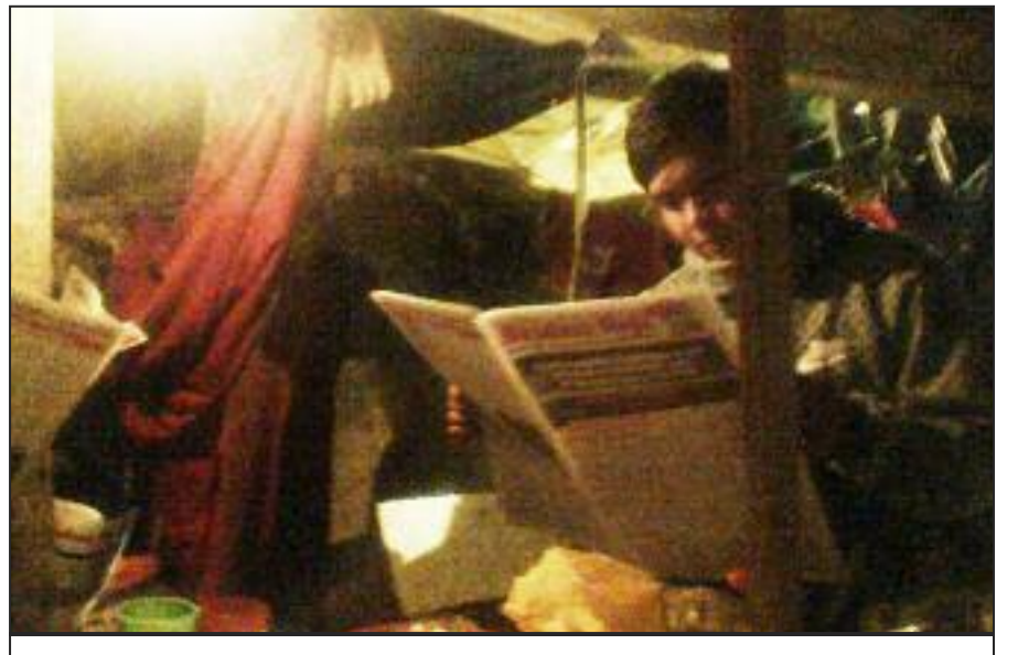
Mexico, October, 2016--Teachers in encampment reading Red Flag

Some criticize the "parties to the pact for Mex-