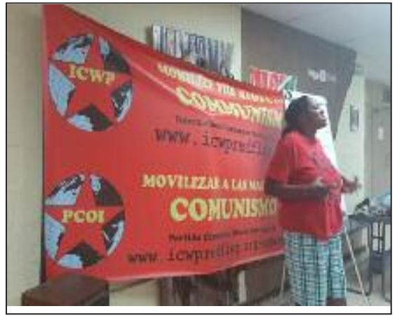
South Africa 2016

Rising capitalism made things worse. Enslaved men and women saw their common inter-Agricultural societies distinguished "women's" from "men's" work but respected both. But capitalism elevated monetary "exchange value" above "use value." So wage-labor (for money) devalued women's unpaid (although