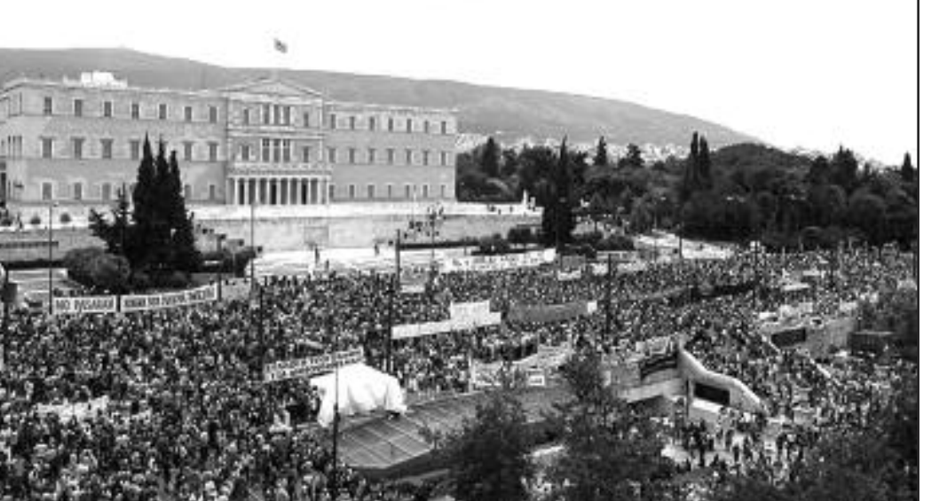
Greek workers surround Parliament to prevent elected representatives from voting to support the Euro-zone bail-out. Only communism can solve this crisis.

Rather than once again saving these capitalist institutions, we have to mobilize to shut down the capitalist's crap game once and for all.