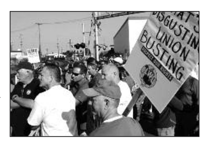
Longview, Washington, longshore strikers face off against cops

This action of signing the letter gave us the opportunity of struggling with those same signers to join ICWP and to help massively distribute our newspaper Red Flag and the document Mobilize the Masses for Communism (MMC).