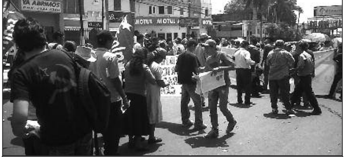
El Salvador, May Day, 2011