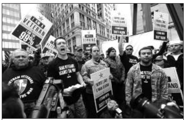
Angry Veterans of US wars from Vietnam to Iraq protesting at Occupy Wall Street. Soldiers and sailors are key to communist revolution; see articles on page 4

With humility, the International Communist Workers' Party (ICWP) has undertaken the re-