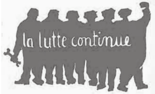
THE STRUGGLE CONTINUES: POSTER FROM FRANCE, 1968

2). Many who are outraged by the revelations want US military criminals prosecuted in an international court. But imperialism throughout its history has meant not only war but torture and mass murder. Instead of relying on an international tribunal of bosses, we need to make the fight against imperialist butchery and brutality a part of the class struggle to smash capitalism itself in every corner of the world. FULL STORY NEXT ISSUE.