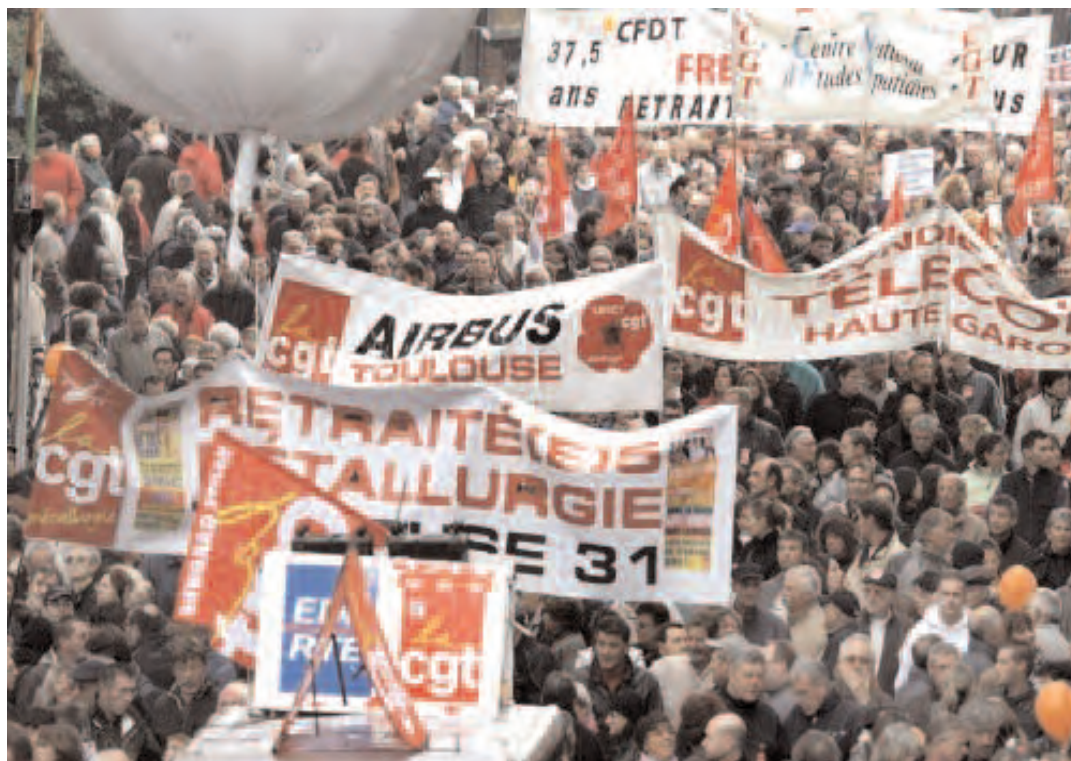
Industrial workers in France lead a general strike

When it came to supporting French aerospace workers battling attacks on their pensions, however, he was nowhere to be seen. “After all that posturing about international solidarity the union’s silence was deafening,” commented a disgusted Boeing reader. Workers have volunteered to translate Red Flag articles into French and financially support the paper to help build real international solidarity. (more next issue)