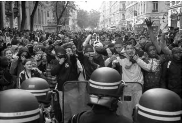
France: Workers and Students United