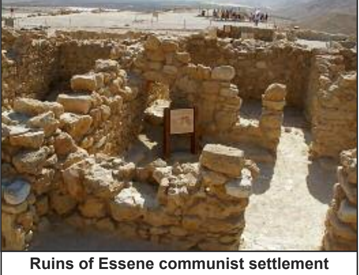
Ruins of Essene communist settlement at Qumran

Religion says that we are all brothers and sis-