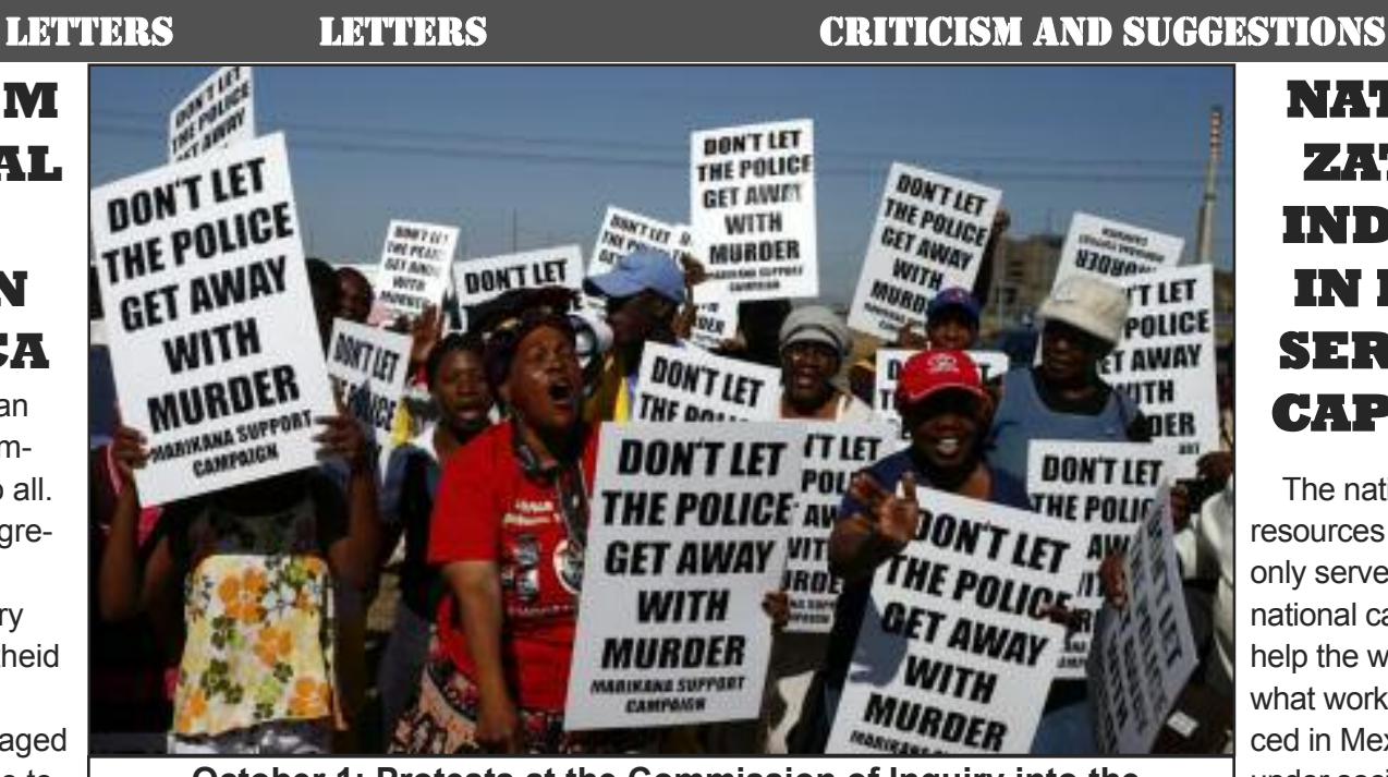
October 1: Protests at the Commission of Inquiry into the police murders at Lonmin's Marikana mine.

The answer apparently lies in laws of revolution and in the history of the South African struggle. With the end of apartheid, the South African communist party (SACP), the Coalition of South African Trade Unions (COSATU), and the African National Congress (ANC) formed a political alliance to rule the country. The capitalist state remained unchanged, and the nation pursued a false anti-imperialist orientation. There was no nationalization of the major industries. There was no break with capitalist economic relations. There was no movement to organize Soviets of workers and peasants to rule the now non apartheid state. Instead, blacks were hired into the military and into other vital parts of the government while some South African blacks gained ascendency into economically powerful positions. There have been anti-immigrant riots in South Africa against Africans from other nations who migrate without documents, seeking work. South Africa has positioned itself with na-