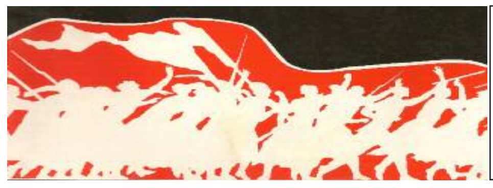
The struggle against wage slavery in the sweatshops of New York, 1909.

JOIN THE INTERNATIONAL COMMUNIST WORKERS' PARTY (ICWP) WWW.ICWPREDFLAG.ORG — (310) 487-7674 E-MAIL: ICWP@ANONYMOUSSPEECH.COM WRITE TO: P.M.B. 362 3175 S. HOOVER ST., LOS ANGELES, CA 90007, USA