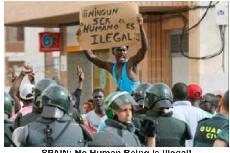
SPAIN: No Human Being is Illegal!

Wherever the working class is, there will always be a cell working to destroy capitalism! We are the working class! We are ICWP! LONG LIVE COMMUNISM!