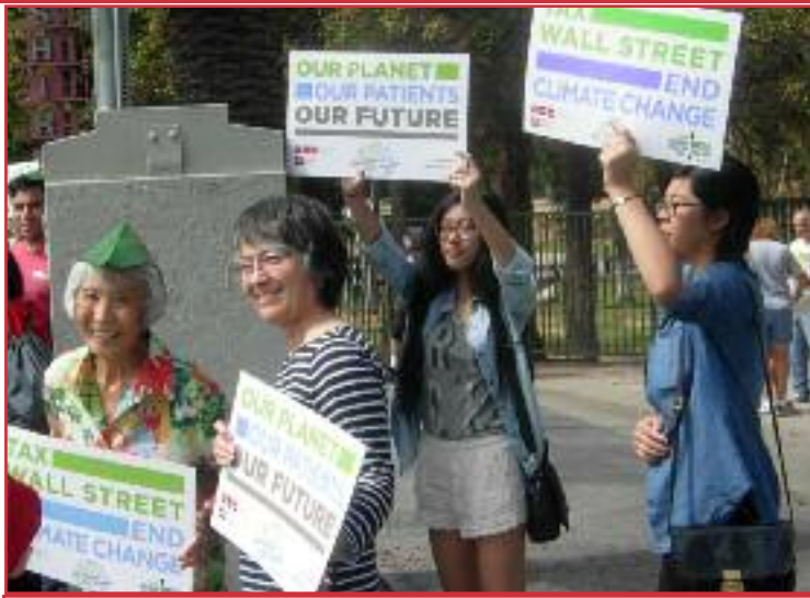
LOS ANGELES, Sept. 20—California Nurses' Association joins climate protest. ICWP comrades distributed Red Flag and opened discussions about how capitalist competition for maximum profit drives everything, including the growing climate crisis. We explained that only mobilizing the masses for communism – not "taxing Wall Street" or other reforms - can end the evils of this deadly system.

In India, Prime Minister Modi talks out of both sides of his mouth. Sometimes he denies that climate change is an issue; at other times he brags about fighting it. But the Modi government has doubled the carbon tax from $8/ton to $16/ton and increased the budget for solar power. The Indian capitalists may see climate negotiations as a Rulers