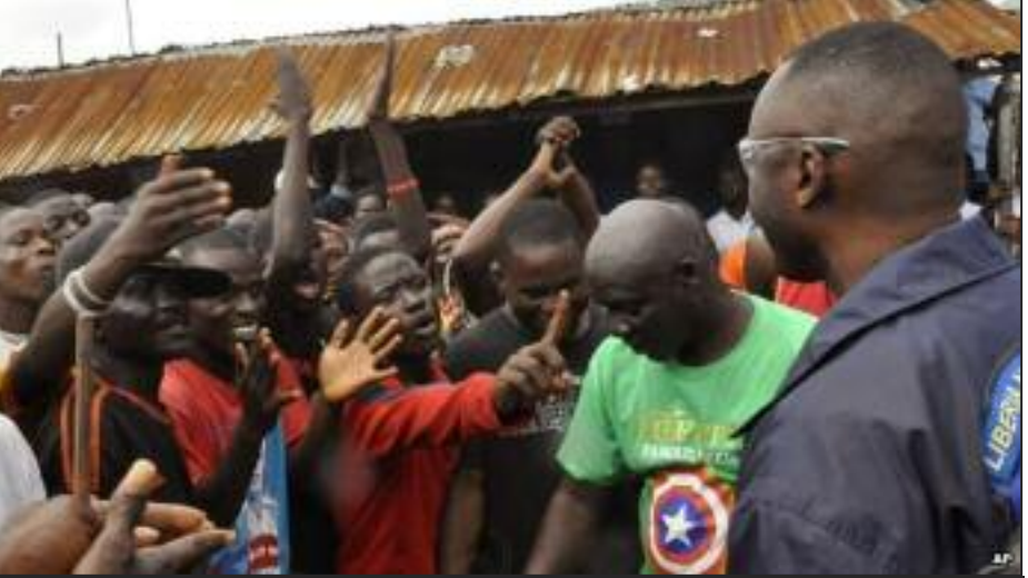
Angry Liberian workers confront fascist police terror during Ebola epidemic

In the 1970s a number of African countries had government-sponsored medical care. In the 1980s some got into debt trouble and asked the International Monetary Fund (IMF) to bail them out. As usual the IMF imposed a series of "structural adjustment policies" as a condition of the loan. These conditions aim at making sure that governments cut back spending for things like medical care or food subsidies, so the big banks will get paid back at the expense of the working class. The World Bank and the IMF want everyone to be dependent on