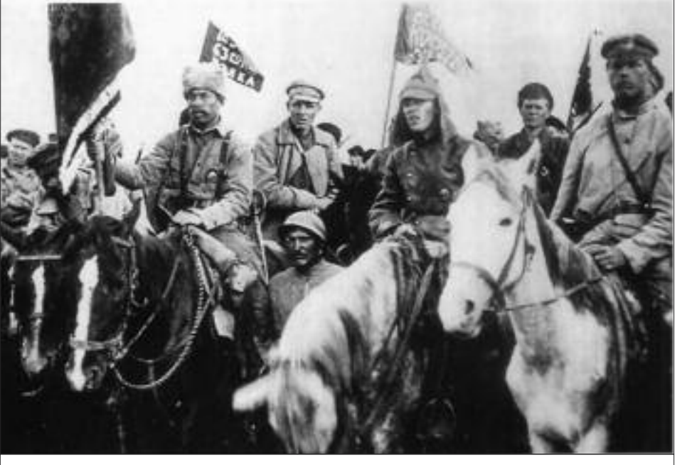
Soviet Red Army Cavalry 1920

He knows technology isn't decisive to win wars. No sane armed force would frontally attack what he calls "a wall of steel," a frontal attack on a well-armed enemy with mass troop strength. Dispersion of many troops over hundreds of