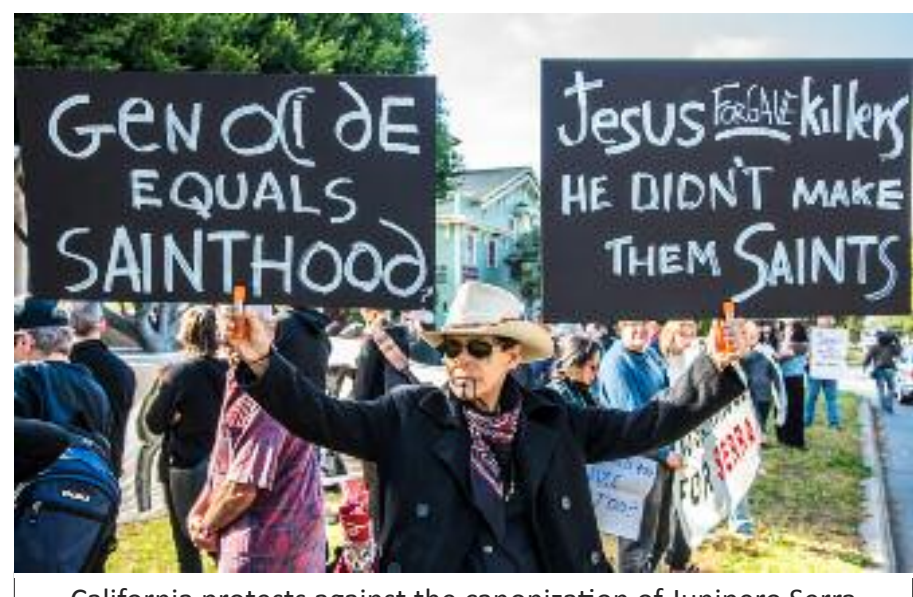
California protests against the canonization of Junipero Serra

The history and present actions of the Catholic