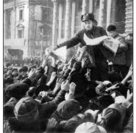
Street Rally, Shanghai, January 1967

The next article will describe how the "ultra-left" continued to grow. We will draw important lessons from its great strengths and fatal weaknesses.