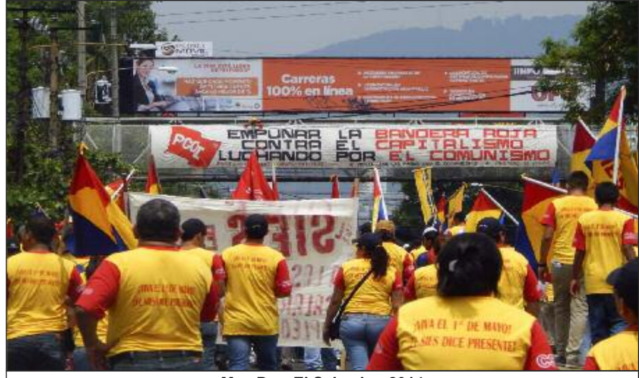
May Day, El Salvador, 2014

Communism and ICWP will put an end to years of liberal and harmful leaders of the working class. Our party will not make alliances with the bourgeoisie for any reason. Our party is growing and is nourished by the masses. We will make