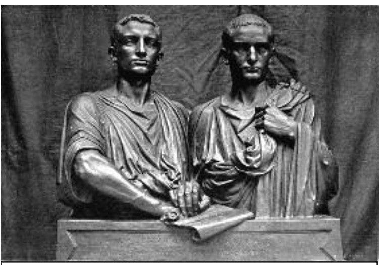
Tiberius and Gaius Gracchus

Tiberius was killed in 132 BCE (the same year