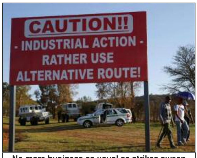
No more business as usual as strikes sweep South Africa