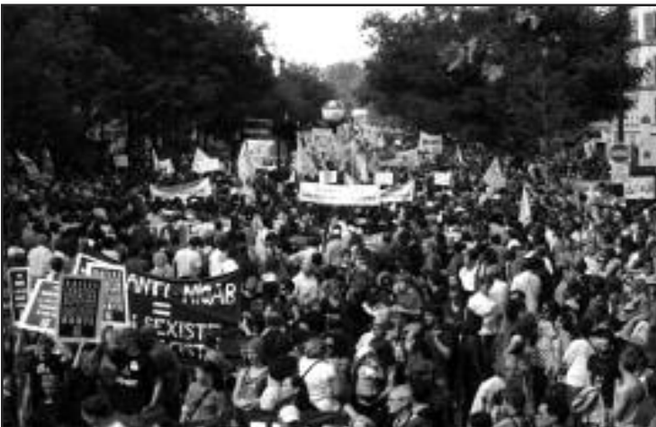
Mass French Protest Against Anti-Roma Racism

To the left is the bumpy and often unmarked communist road. As the editorial in V. 2 #17 said, "like it or not" this is the only road that leads forward. Workers and youth in and around the Party