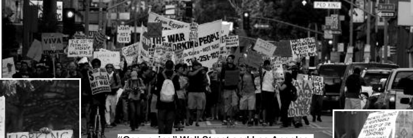
"Occupying" Wall Street and Los Angeles

NEWSPAPER OF THE INTERNATIONAL COMMUNIST WORKERS' PARTY * WWW.ICWPREDFLAG.ORG