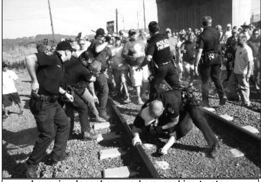
Longview longshore workers, seeking to stop grain shipments, fight the police

Capitalism hasn't triumphed over communism. The USSR's downfall was the fall of socialism. Socialism was state capitalism led by communists, who eventually became capitalists themselves. Learning from history, ICWP fights for mobilizing the masses directly for communism to end capitalism forever. "Frustrated voters," says the NYT , "do not know where to turn at a time when the political choices of the cold war era seem hollow." Those choices were indeed hollow, as the old communist movement never fought for communism.