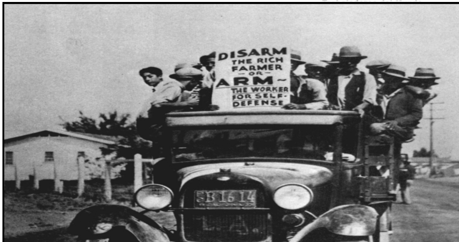
Strikers, Pixley, California, 1933, responding to armed attack by cotton bosses.