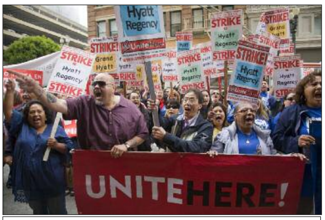
Hotel Workers Strike, San Francisco, 2011

If these ideas appeal to you, please contact the International Communist Workers' Party