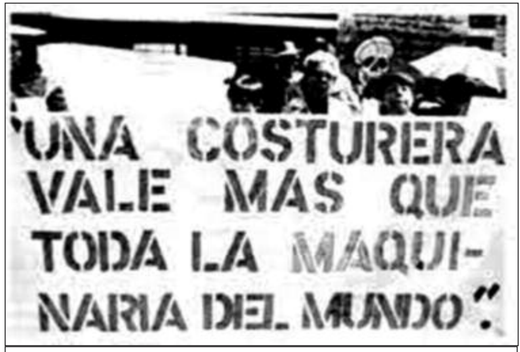
Mexican garment workers, September, 1996 "One garment worker is worth more than all the machinery in the world."

We workers around the world have the experience that only in cases of natural disaster do we respond to the needs of other workers, whether it is earthquakes, floods, or tornadoes. But these are temporary and this need is forgotten with time. Even the past experiences of wars have been forgotten, because we don't see how they can be repeated.