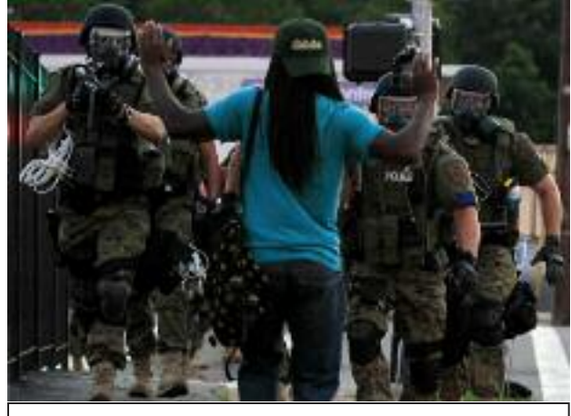
Ferguson, August 2014

When masses are in motion as they are today, their movement can become a battleground: on one side, efforts to make it a school for communism; on the other, attempts to make it a tool to tie the masses more securely to capitalism.