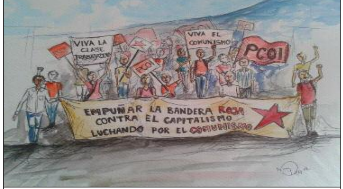
Raise the Red Flag against Capitalism, Fighting for Communism

Thus we are showing as a lie the idea that the bourgeoisie tries to make us believe, that the criminals or the masses of people who form part of organized crime do this because they are bad or because they simply want to be criminals.