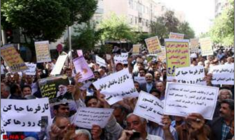
Teheran, 2015: Workers celebrate May Day in Iran for the first time in eight years.

Or it could mean rapid change for the better, if Red Flag readers spread communist ideas to