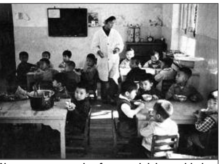
Nursery on grounds of research lab provided all-day childcare.

scribed as "transitional" which would have been bad enough. Instead "a virtue is made of necessity and turned into a socialist ideal for all women to emulate and prove they are revolutionary." The main work of the Women's Federation, led by the Chinese Communist Party, was the ideological struggle to get women to accept the double-burden of sexism.