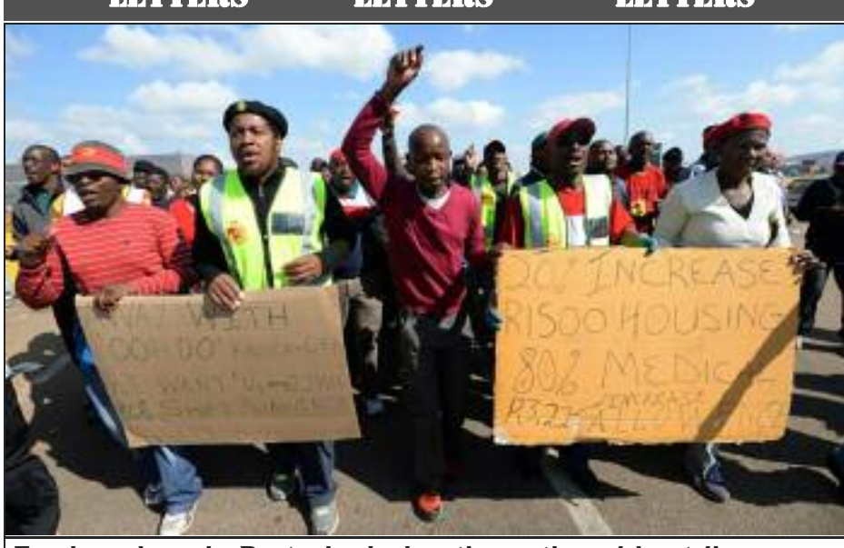
Ford workers in Pretoria during the nationwide strike wave in the summer of 2013