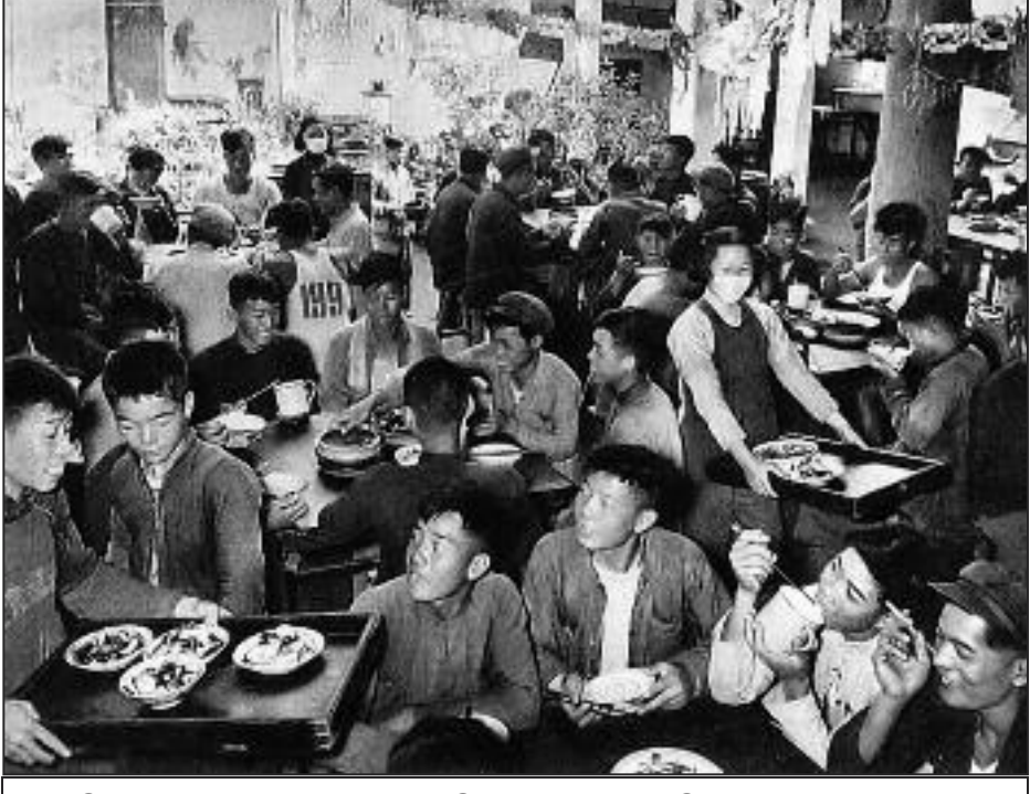
Canteen in a People's Commune in China during the Great Leap Forward

On paper, women were to receive "equal pay for equal work." However, work traditionally done by women (such as picking cotton or harvesting grain) was not considered equal to work traditionally done by men. An hour of "women's work" was typically allotted fewer work points than an hour of "men's work." That meant a smaller share of the total value produced by the