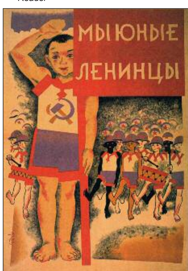
Poster for Young Leninists in the Soviet Union in 1925. The Bolsheviks took seriously the education of the next generation, as well as the fight against all forms of racism.