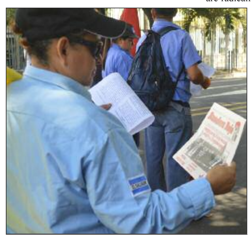
Workers reading Red Flag on May Day, 2015, in El Salvador

profits and that the worker doesn't rebel. There are laws that allow strikes but when these strikes are radicalized, the judges declare them illegal;