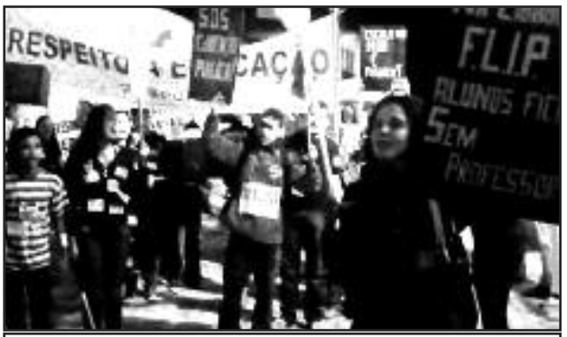
Striking Brazilian Teachers Protesting Bosses' Literary Festival Need to Learn to Fight for Communism More Next Issue

Read and distribute Red Flag , the newspaper of the international working class.