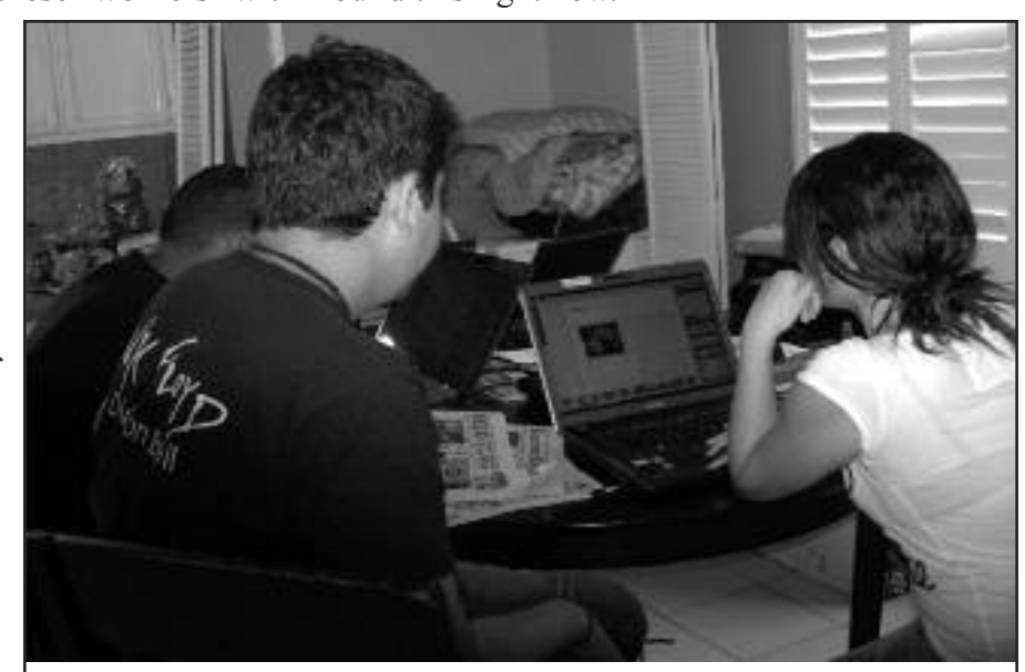
Summer Project Volunteers Working on Red Flag

In a communist system workers decide the future of the working class of the world. We need to wake up and fight back. Instead of asking, "How long can I last?" we should ask, "How long workers leave with less than 20 years of service, until our class can get rid of capitalism?" Postal