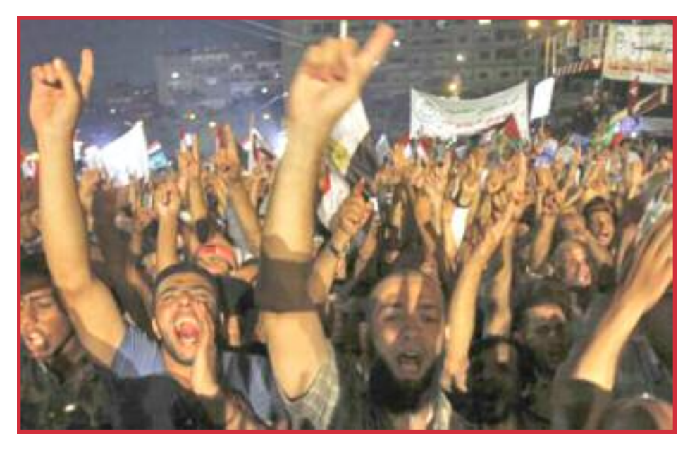
EGYPT, SEE PAGE 8