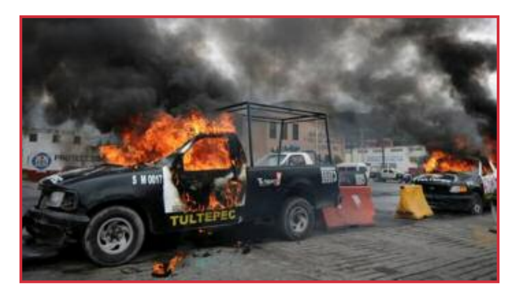
MEXICO, SEE PAGE 4

BOEING & MTA WORKERS BUILD COMMUNIST SOLIDARITY WITH BRAZILIAN MASSES PAGES 3& 4