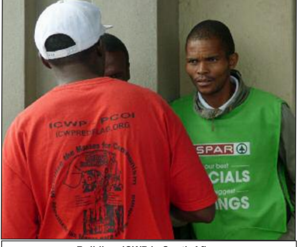
Building ICWP in South Afirca

We will also be starting with our classes on dialectical materialism with those comrades we recruited at an Economic Freedom Fighters rally on May Day. These were the comrades who sang the Internationale in Xhosa.