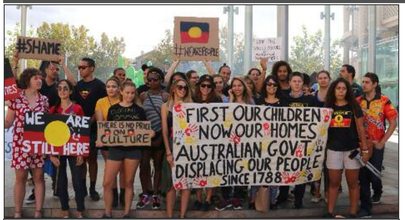
March 19 – Tens of thousands of people joined rallies and marches in big cities and small towns across Australia, like the one above in Perth, for "Close the Gap" day. They focused attention on the racism that creates lower life expectancy, fewer jobs, and employment possibilities, and worse schools for Aboriginal people. The day of action targeted a plan to evict residents from 150 or more Indigenous communities. We hope that Red Flag readers with friends in Australia will get this issue of the paper to them!