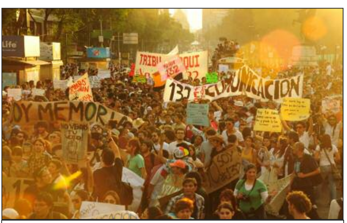
Mexican students protesting the PRI must shed their illusions in elections