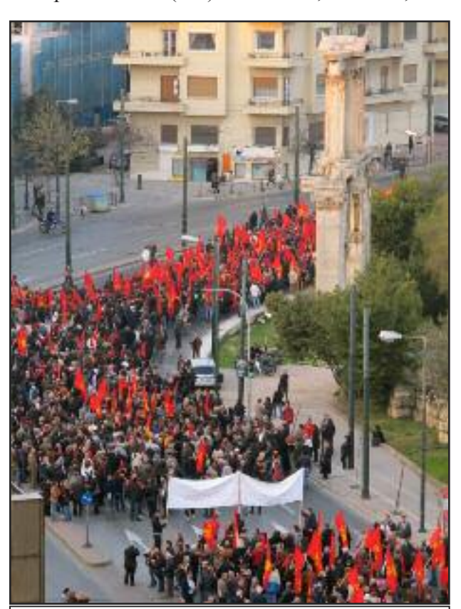
Greeks Protest EURO Zone Austerity

Look at the elections in Greece. In May, the left-wing party Syriza "won" but couldn't form a coalition government. This forced a new election in June. Despite getting even more votes the second time, Syriza lost. Within days, the new Prime Minister Antonis Samaras pledged loyalty to the European Union (EU) and to US, German, and