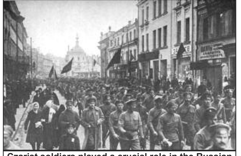
Czarist soldiers played a crucial role in the Russian Revolution.

The coming draft, the DREAM Act and the bosses' growing fascist attacks present an opportunity to mobilize masses of soldiers, workers and students for communism. This is more and more urgent and do-able as the bosses put their fascist plans into practice. Join the battle for our communist future!