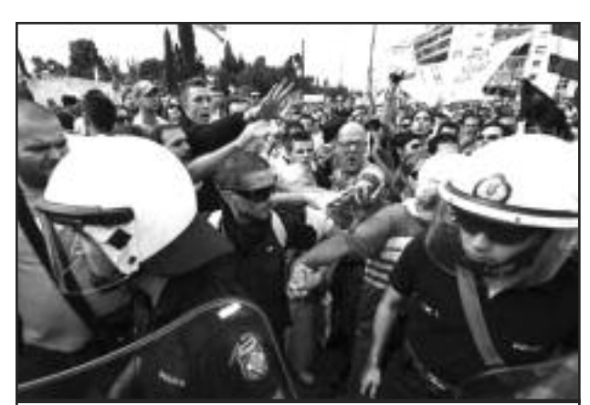
Workers fight cops in general strike in Greece.

They – and the Greek bosses — all agree that the main losers will be the Greek working class. Workers elsewhere in Europe will also be taxed heavily to pay for any bailout of Greece.