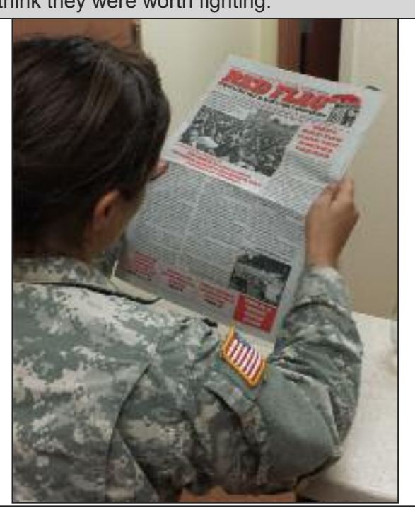
Read our pamphlet: Soldiers, Sailors, Marines: Crucial to a Communist Workers' Revolution icwpredflag.org/MIL/mpe.html