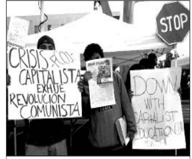
Read our pamphlet: Communist Education for Classless Society icwpredflag.org/EDU/EdPamE.pdf

There are other examples. Readers should share their ideas and experiences in Red Flag . This is a very important area and many people are interested!