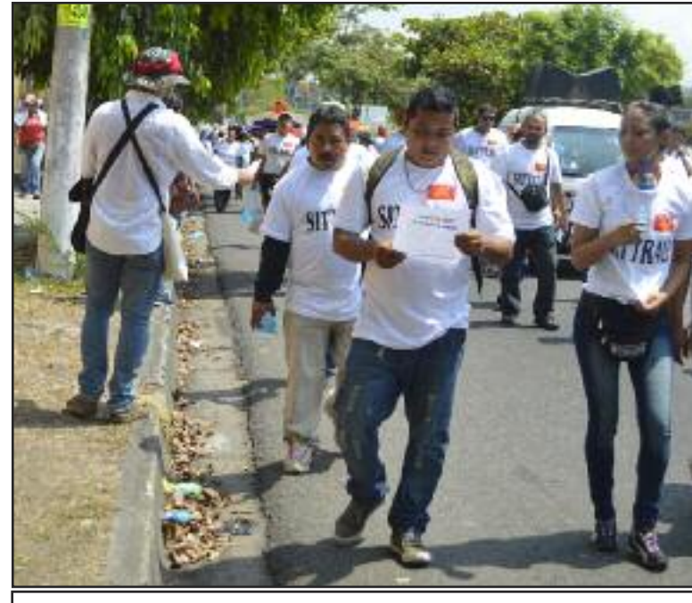
May Day, 2015, El Salvador