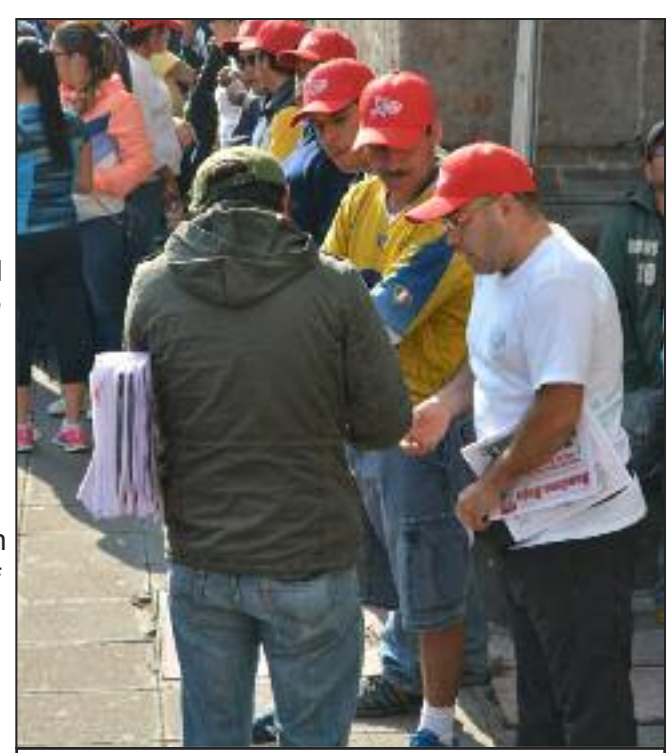
Distributing Red Flag , Mexico City, May Day 2015