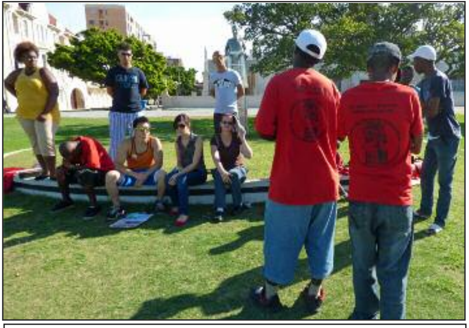
Comrades in South Africa organizing for May Day

Dialectical materialism is the science of the working class which teaches us that the contradictions between the working class and the capitalist class must be resolved violently by communist revolution. Learning from and inspired by the Baltimore rebellions, the comrades have made plans to distribute the Red Flag and our literature to autoworkers around here. One of the comrades in an industrial work force is also recruiting inside the factory.