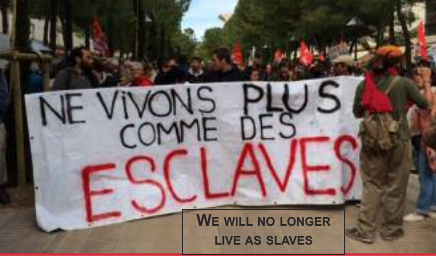
GENERAL STRIKE IN FRANCE: COMMUNISM, NOT SOCIALISM, WILL LIBERATE OUR CLASS SEE ARTICLE, PAGE 4

Over the weekend we studied dialectical materialism, the communist philosophy of change (see www.icwpredflag.org for Dialecti cal Materialism series). We used many practical examples of daily activities where changes take place, including eggs and rugby balls, workers and bosses. To make scrambled eggs we need an egg, not a rugby ball. To fight for communism, we need to mobilize <u>See SOUTH AFRICA, page 2</u>