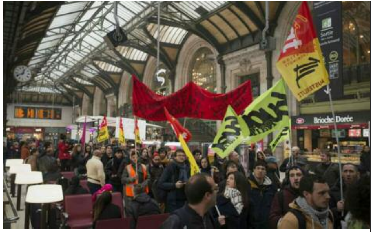
FRANCE, May 16—Thousands of railway, port and airline workers went on a political strike against Hollande's new anti-worker labor reform law, joining masses of students in the streets. Transportation has been snarled across France and even in England. This shows the huge potential of the mighty industrial working class! But reform struggles, no matter how large or militant, cannot meet the masses' needs for meaningful work and a decent life. Red Flag readers in France and everywhere must begin to organize political strikes for communism and point to the need for communist revolution.