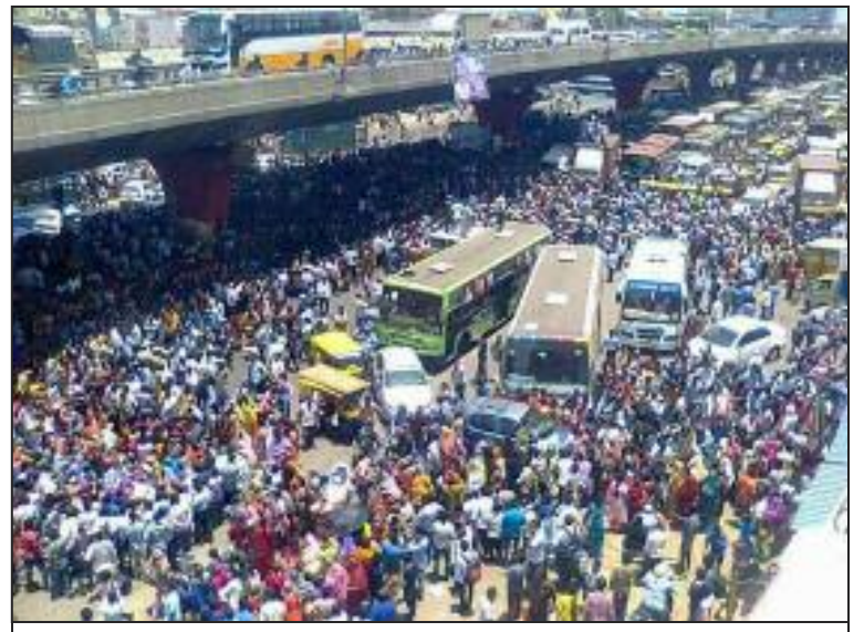
Mass strikes of garment workers in Bangalore shut down a major highway

They are looking for radical alternatives. They are open to communism. We must win them to see that "the heaving of the sacks of money" stolen from our labor and the horrors capitalism imposes on us to get it can only end by mobilizing the masses for communism. Our task is to win these militant women workers to join ICWP and organize political strikes to mobilize for communism. It takes commitment and determined class struggle to end it. It can't come too soon.