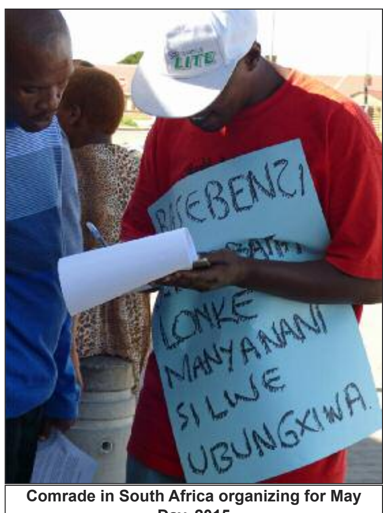
Comrade in South Africa organizing for May Day, 2015 Sign in Xhosa says "Workers of the Unite for Communist