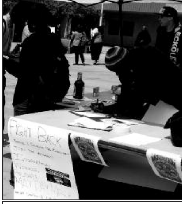
March 27 – Community college students sign condolence cards to the families of victims of racist murder and take May Day stickers, copies of Red Flag , and OccupyLA May Day flyers.

Throughout all these May Day social events,