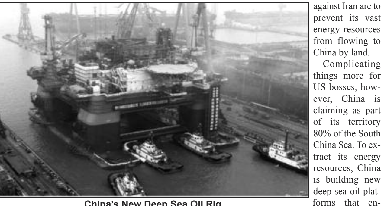
China's New Deep Sea Oil Rig

class must be armed to defend a triumphant rev-