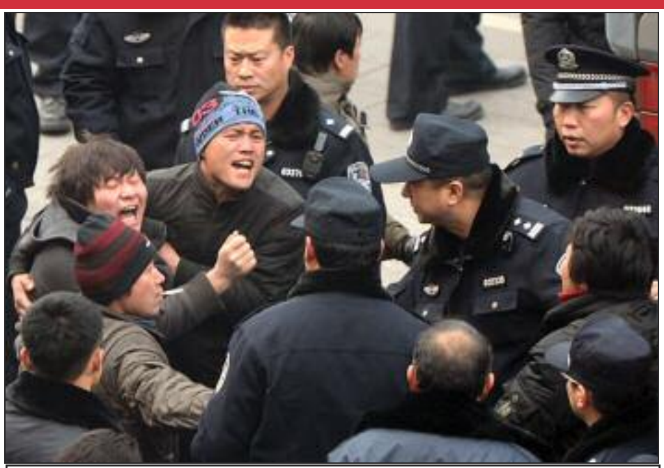
January, 2013 — Chinese migrant workers in Beijing confront police after a sit-in at a construction firm, protesting unpaid wages.

Then the new crisis began in the late 60s. It too was a crisis of overproduction. Bretton Woods (the International Monetary Conference that set up the US-dominated monetary system) and the post-WW II monetary agreements began to fall apart. Socially and politically, the youth of the world exploded in protest against both versions of capitalist relations of production – socialist