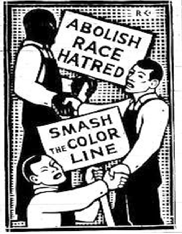
Communist Party USA poster, 1930—should have said "Fight for Communism"

A South African report exposed the government's plan to divert the anger of super-exploited or unemployed black youth towards small "spaza" shops owned by Somalis, Ethiopians and