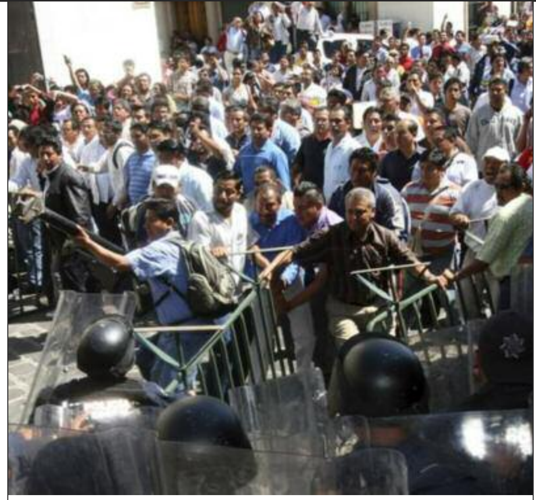
Teachers in Oaxaca, Mexico, February, 2011, fight cops during strike against capitalist school restructuring