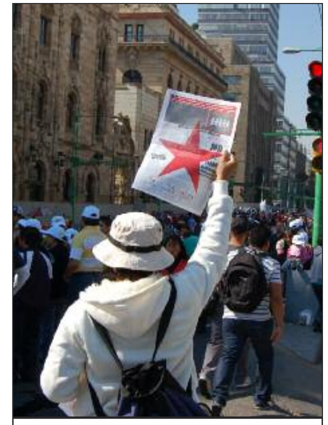
May Day, Mexico City, 2013

Now, lowering the volume of the music and taking the discussion more seriously, they came to the conclusion that the whole system is corrupt, that the bosses were the most interested in pushing drugs, like the music