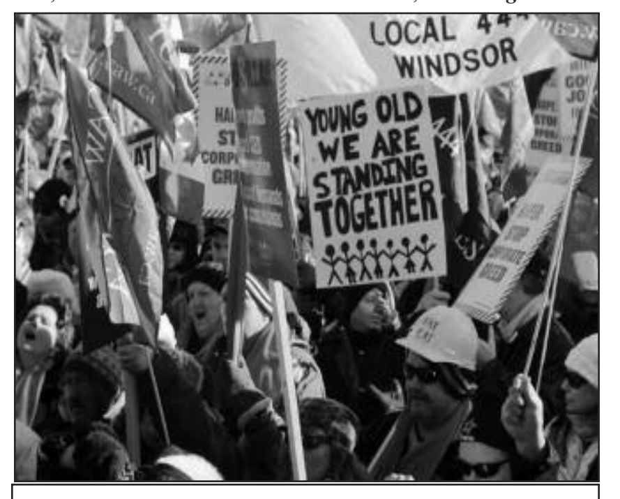
LONDON, ONTARIO, CANADA, Jan. 21—Caterpillar Inc locked out workers and threatened to move to the US after they rejected a contract offer that would have slashed wages in half and cut benefits while the company reports record profits.

Today, communist class struggle is our "classroom" as we organize for communist revolution and prepare to build communist society. Every Red Flag reader must become a teacher as well as a learner! Read, discuss, support, distribute, and write for our "textbook," Red Flag !