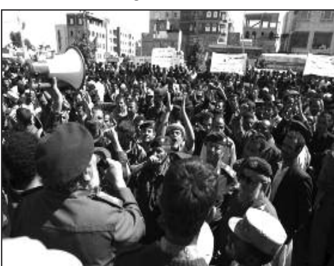
The Yemeni government is desperately trying to crush a wave of mutinies at military airbases. Rebellious soldiers have demanded the ouster of officers who steal from them and amnesty for those who refused to fire on protesters.

For the imperialists, serious steps need to be taken before launching the next war. First, the US