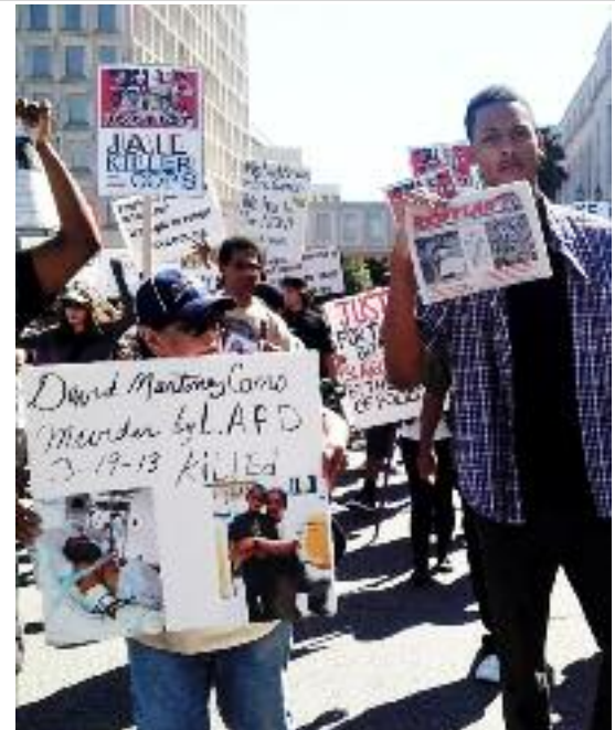
Protesters against racist police murder have welcomed Red Flag. We must follow this up by building ties and discussing communist ideas.

In the classrooms (integrated, of course) we will devote plenty of time to telling the true his-