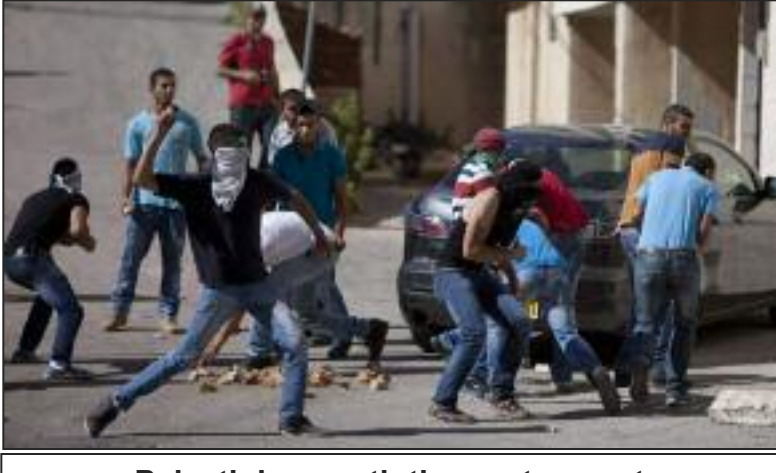
Palestinian youth throw stones at Israeli soldiers during clashes near Ramallah, July 25, 2014

What happens to Israeli apartheid then? Rival imperialists are already taking advantage of weakening US imperialism to extend their reach in the Middle East. China's large purchases of Israeli weapons systems signal an emerging military relationship. However, its priority is securing petroleum reserves and shipping routes, not propping up Israeli apartheid.