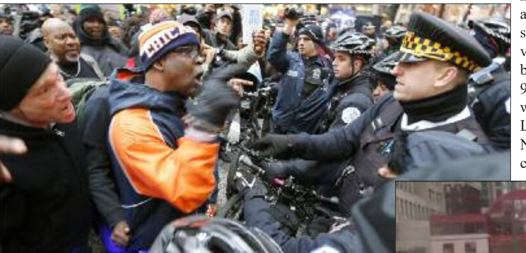
Mass protests against racist killer cops in Chicago (left) and Cleveland (right).

It's the job of our party to make this happen by getting out more Red Flags and leaflets in these growing movements against racist police murder. To massively recruit workers, students and soldiers to be active members of ICWP is our goal. This is the highest expression of class consciousness.