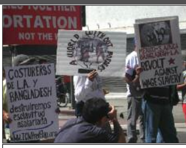
Garment Workers in Los Angeles

The RAF (British Royal Air Force) personnel stationed in India were responsible for expediting India's independence. Basically they rebelled against the government citing that they had fought for freedom and it was unacceptable that they should be asked to operate as oppressors. The RAF mutiny occurred throughout the Empire and in Britain. It has been hushed up, of course. My father was in the RAF at the time between 1947 and 1949. It became so re-