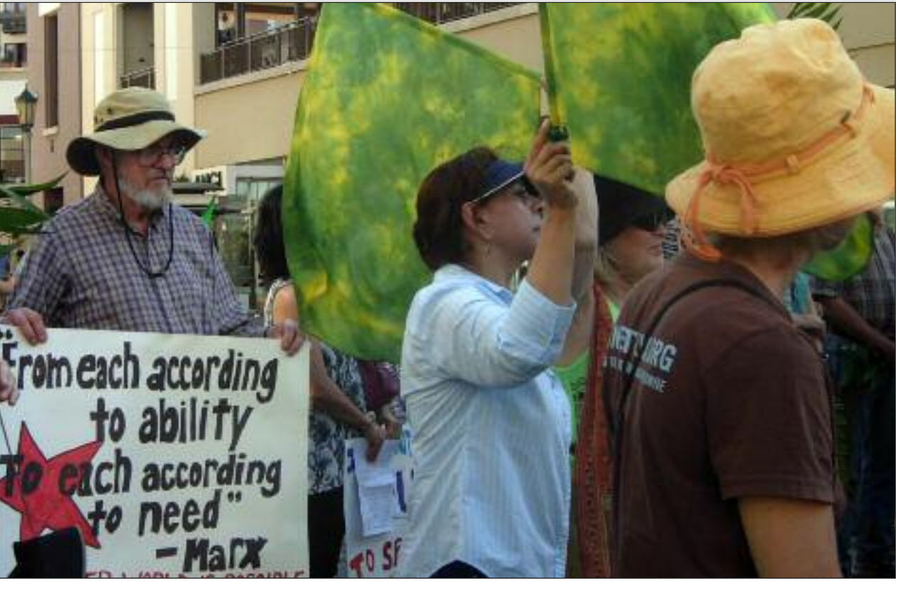
Let's Begin Now to Develop Communist Labor Habits

The key to making society work without money is communist labor: in Lenin's words, "labour performed gratis for the benefit of society, labour performed not as a definite duty, not for the purpose of obtaining a right to certain products, not according to fixed quotas, but vol-