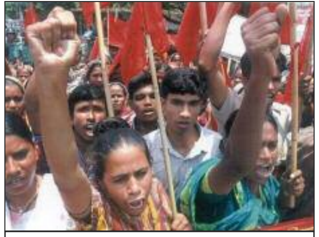
Bangladesh: Garment workers

The last paragraph of the letter says, "One of the other conclusions he drew from his war experiences was an emphatic, 'No son of mine is