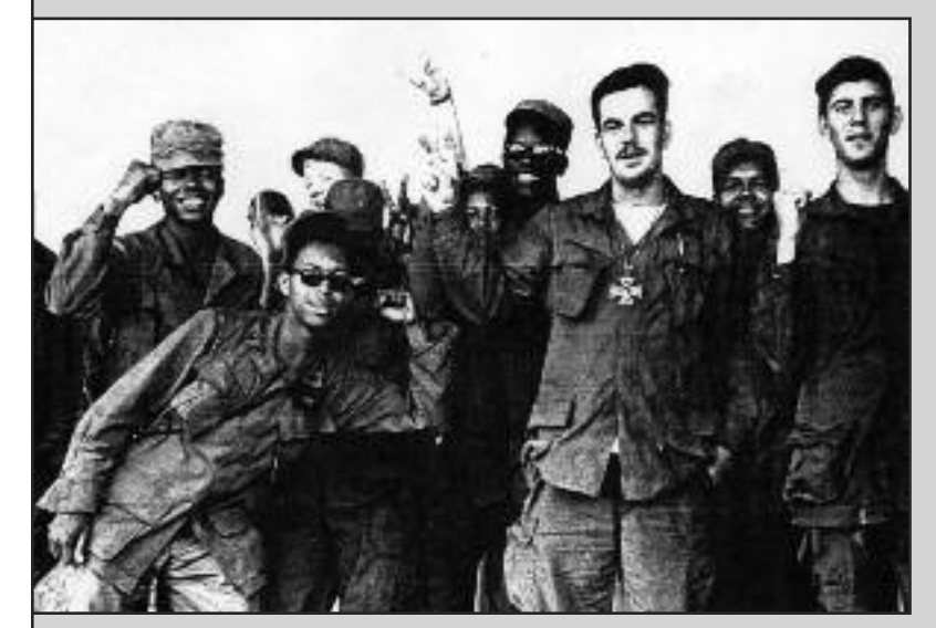
Rebellious US soldiers in Vietnam