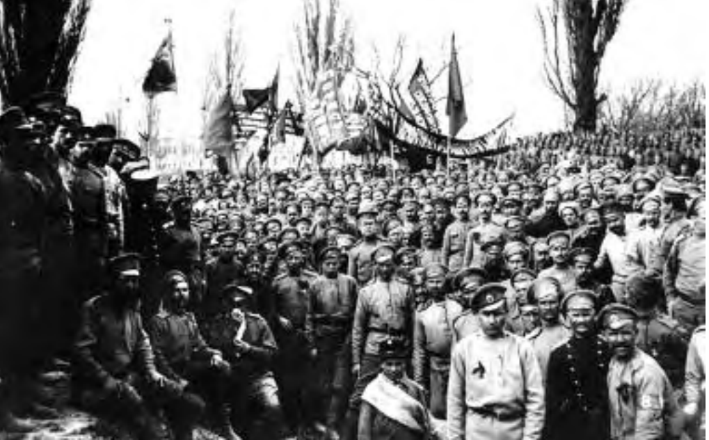
Rebellious Russian Soldiers Join the Revolution

Communism won't have secret diplomacy. We don't, and won't, negotiate with our class enemies. Our policy will be exactly what it is today, boldly proclaimed: Smash all borders! Workers of the world, unite! One world, one class, one International Communist Workers' Party!