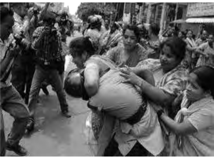
Bangladesh, 2005--Garment workers on strike

To prove that a theory is true, it is necessary to compare it to alternative ideas, test it in practice, and accept it only if it gives the best explanation of the